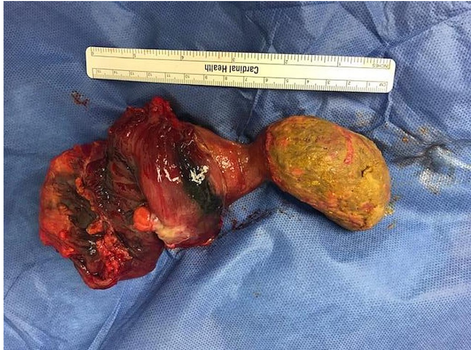
FIGURE 1: Surgical specimen demonstrating a giant, pedunculated colonic lipoma with neighboring colonic tissue grossly normal in appearance

tolerance of an oral diet, oral analgesic medication, and return of bowel function. A pathologic review of the specimen identified a tan-yellow, ulcerated, partially infarcted, pedunculated submucosal lipoma. The head measured 6.8 x 4.7 x 4.5 cm and the stalk measured 6.0 x 3.6 x 3.0 cm with evidence of intussusception of the neighboring colonic tissue as well as 14 reactive lymph nodes (Figure 1). There was no evidence of perforation, invasion into the colonic wall, or extension of the mass to the peritonealized surface.