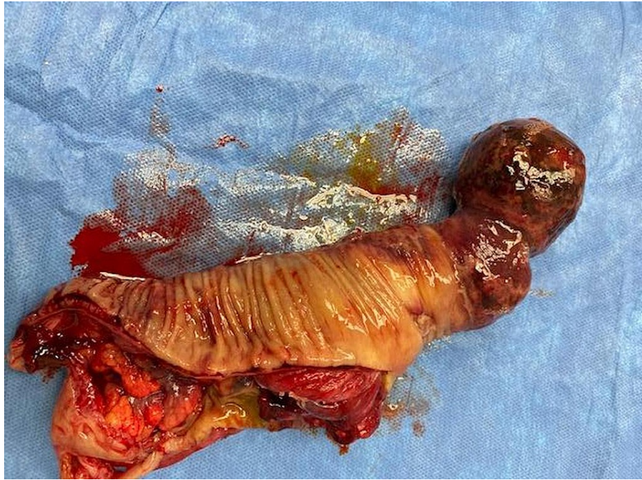
FIGURE 4: Surgical specimen consisting of a giant colonic lipoma and segment of intussuscepted colon