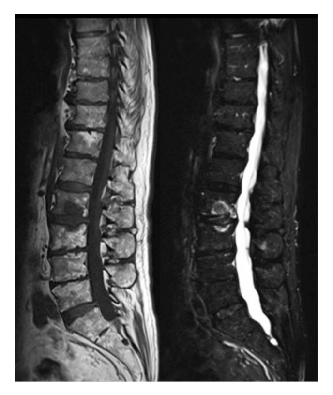
Figure 3 Aseptic spondylodiscitis. Sagittal TI-weighted and STIR sequences in a patient with longstanding psoriatic arthritis show disc oedema with subchondral bone marrow involvement at L2-L3 level, consistent with aseptic spondylodiscitis (Andersson lesion).

Jadon et al<sup>63</sup> found that in psoriatic SpA, spondylitis without sacroiliitis was common and usually asymptomatic. The burden of the disease in psoriatic SpA is similar to AS, despite being less severe radiographically. Psoriatic SpA could represent a different phenotype of disease depending on the presence of certain other factors