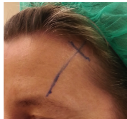
Figure 1: Marking of the vector for the eyebrow elevation

Before the intervention the vector of the planned brow lift is checked by pulling up the skin with one hand. The patient is invited to check the effect in the mirror. The resulting vector ranges between 30 and 70°. The vector line is drawn crossing the temporal hairline and a few centimetres behind this hairline, above the temporal muscle, a rectangular line is drawn to reside in a cross (Figure 1).