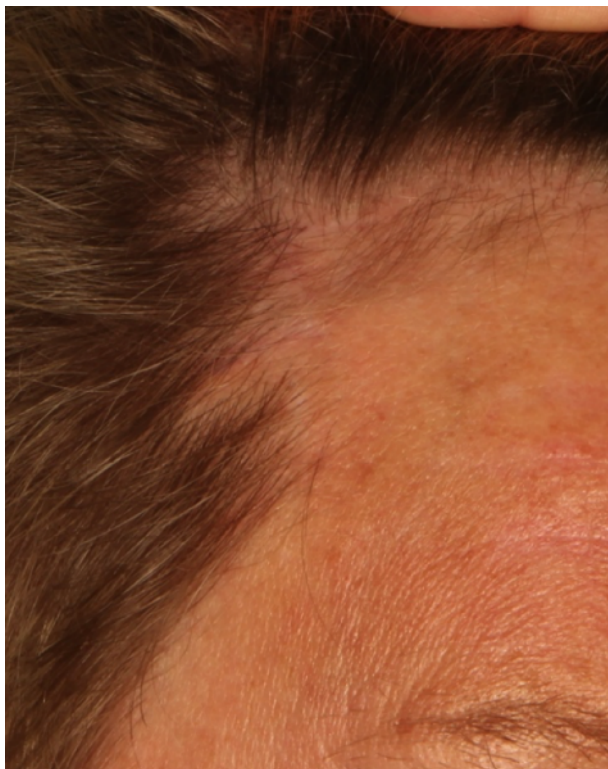
Figure 9: The scar is barely visible after 8 weeks and hidden behind the hair line.

The most common approach is the endoscopic lateral brow lift [12], [13], [14], [15], [16], [17], [18], [19], [20], [21], [22], [23], [24]. The disadvantage of this procedure is difficult stable anchoring and the complexity of the setup. Subcutaneous approaches have been described before [25], [26], [27], [28], [29]. We have developed a variation, which avoids the relatively long incision line above the temporal muscle and results only in a barely visible short zigzag scar (Figure 9).