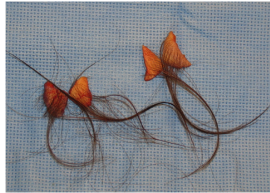
Figure 4: Resected skin, two triangular full thickness slides per side