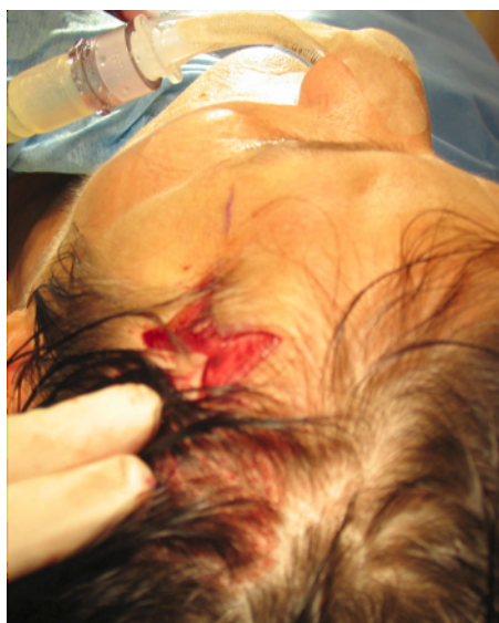
Figure 3: Temporal region after skin excision

The area around the hourglass drawing, along the vector, up to the medial part of the brows, going well to the lateral hairline and below the "crow's feet" is infiltrated with local anaesthetic and epinephrine, usually about 30 to 40 ml per side. In the next step the complete excision of the upper and lower triangle of the hourglass is performed (Figure 3, Figure 4), followed by incision along the line crossing the vector down to the space between the outer and inner sheet of the temporal muscle fascia. The preparation follows this open space for roughly 1 cm in direction to the brows. Then a sharp hook is placed to elevate the skin with the adherent superficial fascia, and using a small blade, this fascia is cut in a semi-circular way to open up again the subcutaneous layer (Figure 5).