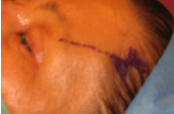
Figure 2: Marking of the hourglass shaped skin excision posterior to the hair line

The arms of this cross will be limited by markings to each one 1 cm length. In this way a shape like a small hourglass is created (Figure 2).