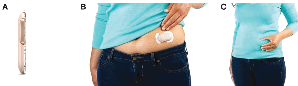
FIG. 1. The patch. The wearable, on-demand, mealtime insulin-delivery system patch (Calibra Medical, Wayne, PA) contains up to 200 units of insulin and measures no more than 65 \times 35 \times 8 mm (A). It can be worn on the abdomen for up to 3 days (B). Mealtime insulin can be dosed in 2-unit increments through clothing by actuating the buttons on both sides of the patch (C).

Study subjects (22–75 years) were recruited from a total of 62 clinical centers in the following countries: the United States ( n=37 ), France ( n=9 ), Germany ( n=6 ), and the United Kingdom ( n=10 ). Inclusion criteria included a clinical diagnosis of type 2 diabetes, treatment with basal insulin for at least 6 months (with/without antihyperglycemic agents), with a stable dose [ \geq 0.3 units/(kg·day); \leq 100 units/day] maintained for at least 6 weeks; HbA1c level of 7.5%–11.0% (53–97 mmol/mol); willingness to perform self-monitoring of blood glucose (SMBG); and a body mass index (BMI) \leq 40 kg/m 2 . Exclusion criteria included treatment with mealtime insulin or continuous subcutaneous insulin infusion within the prior year outside of an acute illness or hospital setting; two or more severe hypoglycemic episodes within the prior year; hypoglycemic unawareness; or moderate-to-severe illness.