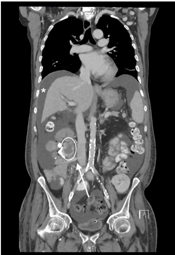
Figure 3. Stenosis of the portosystemic anastomosis of vena cava inferior (arrow). Pronounced jejunal varices in the donor's duodenum (ellipse) after pancreas-kidney transplantation. Asterisk shows ascites.