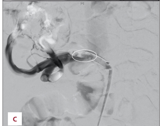
Figure 4. (A) Angiographic dilatation of the portosystemic anastomosis of vena cava inferior with a balloon after pancreas-kidney transplantation. Image of the stenosis (asterisk). (B) Angiographic dilatation of the portosystemic anastomosis of vena cava inferior with a balloon after pancreas-kidney transplantation. Image of the jejunal varices (arrow). (C) Angiographic dilatation of the portosystemic anastomosis of vena cava inferior with a balloon after pancreas-kidney transplantation. Dilatation of the stenosis with a balloon (ellipse).

insufficiency in a long-term steroid-treated patient was given instead of prednisolone. During the complicated course, liver function was impaired with elevated liver enzymes alanine transaminase and aspartate transaminase (ALAT and ASAT) (Figure 2A, 2B). An abdominal ultrasound showed no signs of cirrhosis. Complicating the recurrent hemorrhage was a new positive finding of hepatitis E infection with high viral loads concomitant with ascites and CMV reactivation in the blood.