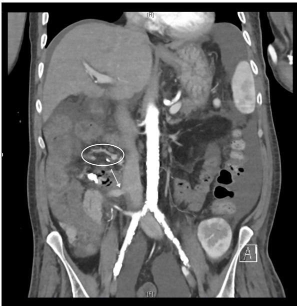
Figure 5. Post-angiographic computed tomography scan. Regressive portosystemic stenosis at the anastomosis at the vena cava inferior (arrow). Persistent jejunal varices in the area of the donor's duodenum after pancreas-kidney transplantation (ellipse).

The patient's health was deteriorating and 2 months after admission he developed hemorrhagic shock.