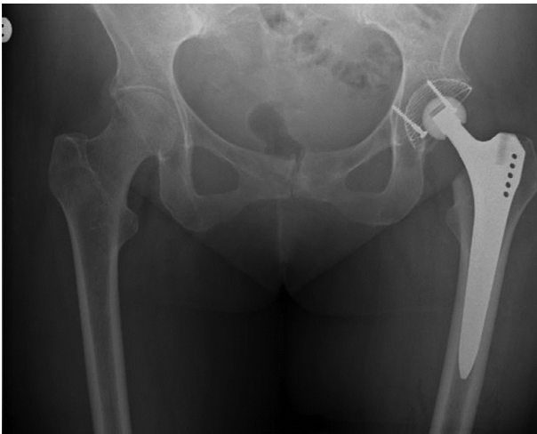
Figure 2. Left total hip replacement.