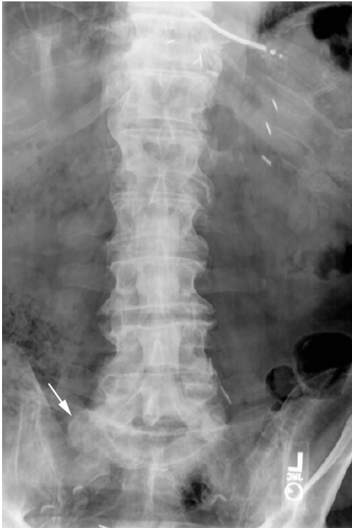
Fig. 1. Anteroposterior X-ray showing osteophyte at junction of L5-S1 on right side (arrow).