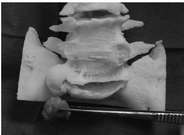
Fig. 3. A 3D model created from CT scans accurately portrayed the location and size of the osteophyte.

77% of patients in their retrospective review of preoperative CT scans in 27 patients showed an asymmetric enlargement of the anterior primary division of the L5 nerve root that was significantly associated with foraminal or extraforaminal compression of the root at the lumbosacral junction. In our case, even more valuable than the CT scan was its extrapolation to create a 3D model. This was helpful to the surgical team's understanding and visualization of the patient's anatomy and pathology. Intraoperatively, the surgeons repeatedly referred to the model. The resected osteophyte closely