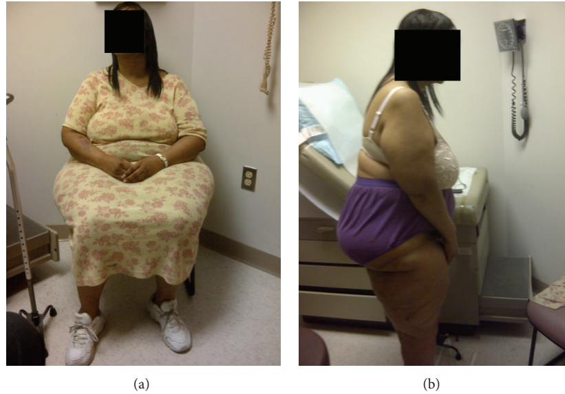
FIGURE 1: 51-year-old black woman with BMI of 42.0 \text{ kg/m}^2 after bariatric surgery, waist circumference of 107 cm, and hip circumference of 155 cm. (a) Seated anterior view. (b) Profile standing.

had increased to 42.0 \text{ kg/m}^2 have been obtained (Figure 1). At the time these photographs were taken, her waist and hip circumferences were 107 cm and 155 cm, respectively. Her overall proportions with a BMI of 42.0 \text{ kg/m}^2 were visually similar to her preorthopedic surgery measurements when her BMI was 33.7 \text{ kg/m}^2 .