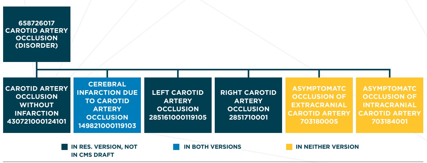
Figure 1. SNOMED Code Representation for Parent and Children of 'Carotid Artery Occlusion' in the Different Measures

We identified key differences in the value set creation process for two similar definitions of the same CQM. Although this did not drastically affect the global measure performance, the two different versions did lead to variations in calculated prevalence of patients at high risk from key conditions, with 7.5 percent difference in performance rates for the aggregate clinical concept 'myocardial infarction', and 3.5 percent performance difference for the concept 'ischemic vascular disease'. Furthermore, there were 41.5 percent (677) more patients included in the aggregate concept 'IVD' as defined by the Res. value set, and 135 percent (148) more patients included in the concept 'myocardial infarction' as defined by the CMS value set. The CQM requirements of new payment systems have operationalized many vocabularies, but deciding how to interpret broad terms such as 'heart attack' and 'stroke' when creating specific sets of codes intended to represent these conditions lead to specific variation and confusion. The implications of these differences extend beyond administrative concerns around measurement, and also directly