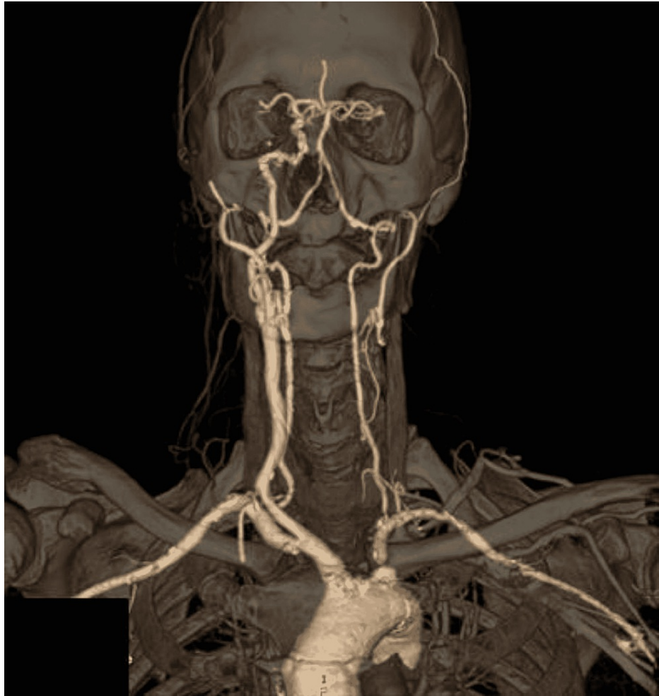
FIGURE 1: 3D head and neck CTA reconstruction (anterior view).

General intravenous anesthesia was planned. We monitored the patient with five-channel electrocardiography (ECG), pulse oximetry, continuous direct arterial pressure measurement, bilateral bispectral index (BIS) monitor (BIS VISTA, Covidien, Dublin, Ireland), bilateral noninvasive cerebral oximetry (INVOS™ 5100C Cerebral/Somatic Oximeter, Covidien, Dublin, Ireland), neuromuscular function (Datex-Ohmeda's M-NMT MechanoSensor, Datex-Ohmeda Inc., Helsinki, Finland), and end-tidal CO 2 . These values were automatically registered with the Centricity software (Centricity™, GE Healthcare, Chicago, IL, USA). Basal cerebral oximetry was 66R/60L, and arterial blood pressure was 223/105 mmHg (mean arterial pressure (MAP): 135 mmHg) before induction.