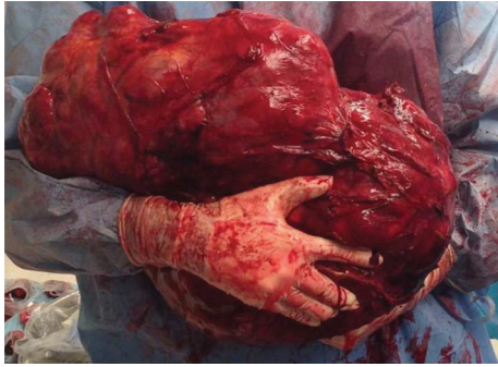
FIGURE 2: Gross image of the resected mass measuring 42 \times 31 \times 23 cm and weighing 18.5 kg.

any severe abdominal pain or other associated symptoms other than abdominal distention with decreased diet tolerance.