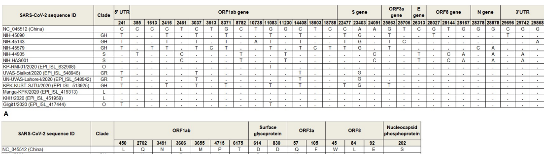
Fig 3. Comparison of SARS-CoV-2 isolates sequenced in the current study with the prototype strain and Pakistan isolates. The nucleotide changes are shown in A and the amino acid variations are presented in B.

https://doi.org/10.1371/journal.pone.0248371.g003