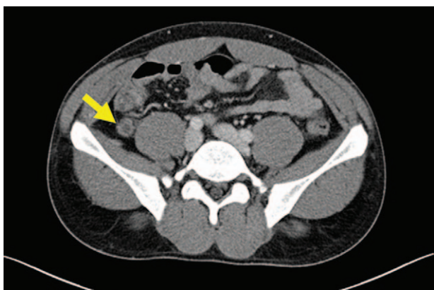
Figure 1. Appendiceal dilatation with wall enhancement in abdominal CT (arrows indicate the dilatated appendix). CT = computed tomography.

(Fig. 1), prompting an immediate laparoscopic appendectomy to be performed after informed consent was obtained.