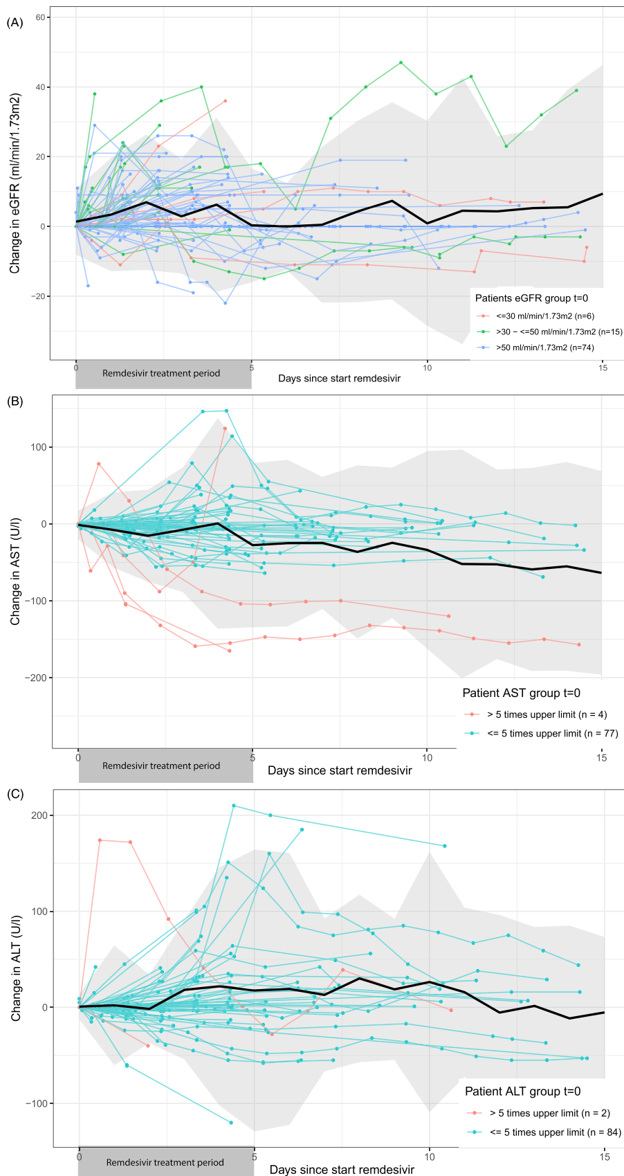
FIGURE 1 Changes in renal and liver function parameters after start of remdesivir treatment in patients with Covid-19. The data originate from the electronic health record of 1 hospital (Leiden University Medical Center, The Netherlands). In this figure changes in estimated glomerular filtration rate (eGFR; A), aspartate transaminase (AST; B) and alanine transaminase (ALT; C) laboratory measurements compared to baseline are shown. Baseline measurement was the most recent before start (max. 30 days), or if not available, the first measurement within 24 hours after the remdesivir prescription in the electronic health record. All coloured data represent individual patient measurements. Patients in red and green would have been excluded from clinical trials, based on their baseline measurements (eGFR: <30 [red] and 30–50 [green] mL/min/1.73m 2 , AST: >5× upper limit of normal [ULN], ALT: >5× ULN). In black, the mean change per day is shown including a 95% confidence interval in grey