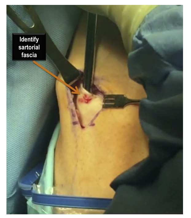
Fig 2. Intraoperative photograph (left leg) showing the location of the sartorial fascia.