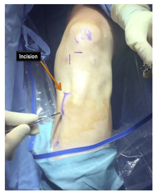
Fig 1. Intraoperative photograph (left leg) showing the location of the incision for semitendinosus and gracilis tendon harvest.

Osseous landmarks are drawn out, including the tibial tubercle, to aid in incision placement. The incision is placed along the pes anserinus (palpable) midway between the tibial tubercle and the posteromedial border of the tibia, and is approximately 2 to 3 cm in length (Fig 1). The skin is incised with a no. 10 scalpel. The incision is carried through the subcutaneous tissue to the sartorial fascia with blunt dissection to the level of the sartorial fascia (Fig 2). Care should be taken to avoid injury to the underlying superficial medial collateral ligament as well as to the infrapatellar and sartorial branches of the saphenous nerve. Injury to the medial collateral ligament can be avoided by visualizing this structure, and injury to the nerve branches can be avoided by using a knife for the skin incision only, followed by blunt dissection of the subcutaneous tissue down to the sartorial fascia. At this time, the rolled borders of the gracilis and semitendinosus tendons can usually be palpated with the pad of the surgeon's finger, just under the sartorial fascia. At the level of the pes, the gracilis tendon is located superior relative to the semitendinosus tendon, whereas the semitendinosus tendon has a bigger diameter compared to the gracilis tendon. A no. 15 scalpel is then used to make an "inverted L"-shaped incision in the sartorial fascia in