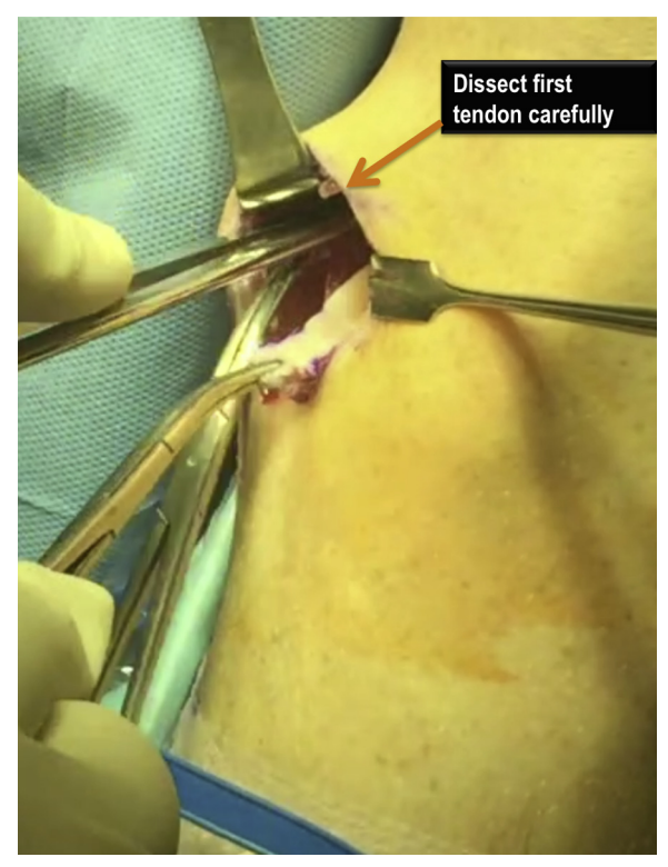
Fig 4. Intraoperative photograph (left leg) showing dissection of the gracilis from the sartorial fascia and from the semitendinosus, prior to harvesting.

The wound is then copiously irrigated and closed in layers in standard fashion. Postoperative restrictions are