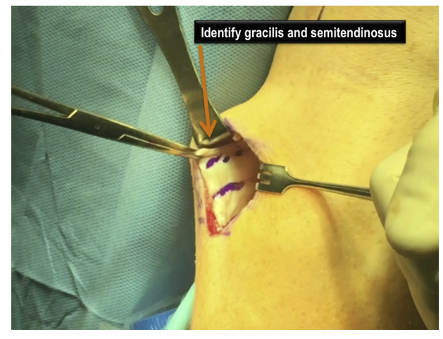
Fig 3. Intraoperative photograph (left leg) showing the location of the semitendinosus and gracilis tendons after dissection free from the sartorial fascia.

At the back table, the muscle tissue is cleared off of each tendon, and the remaining free ends of each tendon are whip stitched. The graft can ultimately be prepared using any one of a number of different techniques based on surgeon preference.