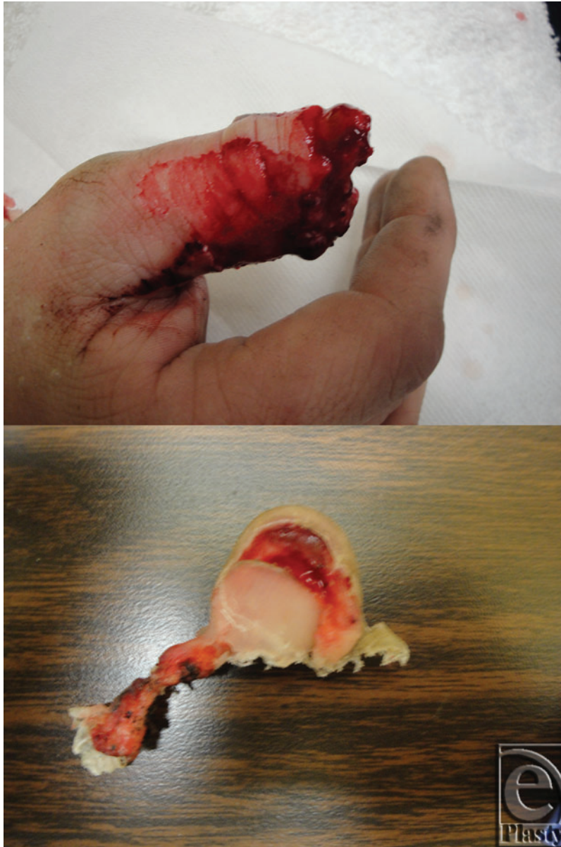
Figure 1. Amputation with significant soft tissue degloving immediately distal to the IP joint. The nature of the injury precluded microvascular repair, and an amputation-revision would have necessitated removing the IP joint ( above ). The amputated segment including nail plate, underlying nail bed, and pulp ( below ).

Postoperatively, the patient was discharged home after his procedure. In his 1-week follow-up, the patient's composite graft—including his nail bed—demonstrated complete survival. At one month, the composite graft maintained stable soft tissue coverage and showed signs of nail plate regrowth (Fig 3). Four months after repair, he was able to