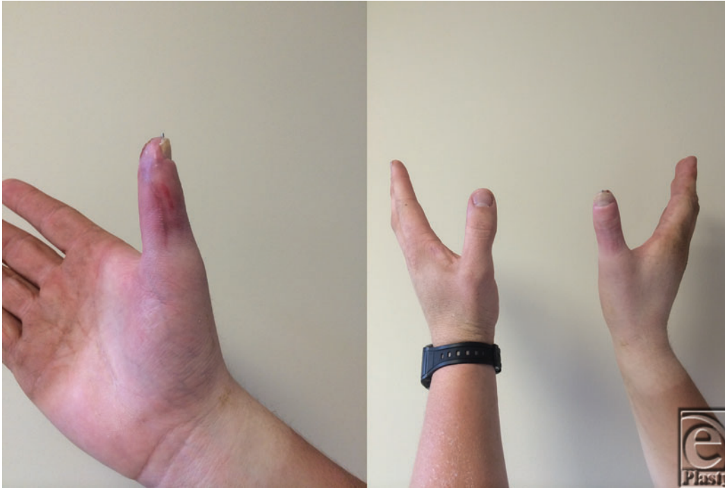
Figure 3. One-month postoperative result showing survival of composite graft with stable soft tissue coverage ( left ). A comparison of the repaired and noninjured thumb ( right ). A slight loss of length is noted, which is attributed to the loss of length of the distal phalanx and the fact that, at 1 month, the nail plate had not regrown fully.