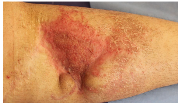
Fig. 4 Appearance of the defect 6 months after surgery. The skin graft healed uneventfully with good pliability

A higher BMI has repeatedly been correlated with increased incidence of surgical complications, including atelectasis, thrombophlebitis, mortality, wound infection, flap necrosis and wound separation (Pitanguy et al. 2000; Matory et al. 1994; Selber et al. 2006). Thus, lower extremity reconstruction in obese patients can be challenging due to the possibility of potential wound healing problems. Although the use of a vacuum assisted closure device (VAC) on split-thickness skin grafts is associated with improved graft survival (Scherer et al. 2002), there is no evidence about the benefits of combined VAC therapy with skin graft in obese patients.