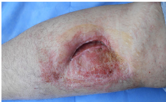
Fig. 1 A 7 \times 1.5 cm defect in the anterior crural region and previous skin grafted area are shown

The operation was performed by a senior surgeon (C.A.K.). Wound debridement was performed until all necrotic structures were removed and the viable tissues were reached. An autologous split-thickness skin graft (0.020 in. thick) was harvested from the posterior thigh using an electric dermatome (Integra® Padgett® Dermatomer; Integra Inc., NJ, USA). The skin graft was placed on the wound and sutured by skin stapler (3 M™ Precise™ Vista Disposable Skin Stapler; 3 M Inc., Minneapolis, USA). Then, 1 cm length squares were marked on the skin graft to determine where the nanofat graft was to be injected. In order to achieve skin graft viability by diffusion, the fat graft was not injected under the whole skin graft. A few small holes were created in the middle of the squares on the skin graft by a no.11 blade to prevent hematoma under the graft. After the infiltration of modified Klein solution (lidocaine 800 mg/liter and adrenaline 1:1,000,000) into the lower abdomen, fat grafts were harvested by means of a 3-mm multiport harvesting cannula with side holes of 1-mm diameter. The harvesting cannula was attached to a 10-mL syringe and the plunger of the syringe was pulled back to create adequate negative pressure. Upon completion of the fat harvest into the 10-mL syringe, the fat grafts were transferred from the