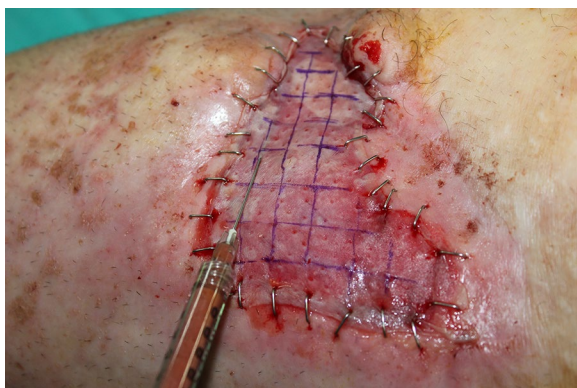
Fig. 3 Nanofat graft was injected under the markings on the skin graft by 23-G cannula

Lower extremity reconstruction can be complicated for both patients and surgeons. Unlike the head and neck, the lower limb is essential for mobilization and, as a result, movement can cause shear forces on the repair. Increased hydrostatic forces in the lower limb during mobilization may lead to hematoma or seroma formation. If there is no exposed bone, tendon or vital tissues exist, various techniques can be used like secondary healing, skin grafting or flap surgery. Although secondary healing is the simplest method, it can only be used for small defects. In defects which have a healthy wound bed, skin grafting is the most convenient technique for reconstruction.