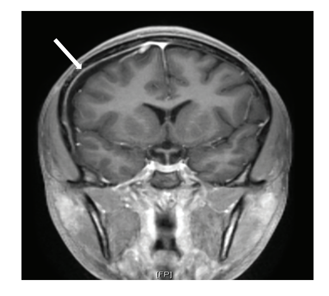
Figure 2. Coronal view of MRI brain post-contrast showing extraaxial collection with the arrow indicating dural enhancement.

portion of the lateral ventricles, consistent with pus or debris. The CSF culture was negative for bacteria, likely secondary to receipt of antibiotics prior to sampling, but the blood culture prior to antibiotic receipt grew GBS. Antibiotic susceptibility testing was not performed. CSF studies for other pathogens, including cryptococcal antigen, detection of herpes simplex and varicella viruses by PCR, and specific cultures for acid-fast bacilli and fungi, were negative. Upon identification of GBS, vancomycin and ceftriaxone were discontinued, and treatment was continued with intravenous penicillin G (4,000,000 units every 4 hours) for two weeks. The patient showed rapid improvement on antibiotic therapy and had