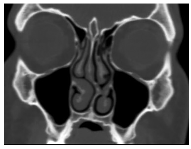
Figure 4. Sinus computed tomography (CT), coronal view from an F-16 fighter pilot who was temporarily grounded for workup of recurrent acute episodes of maxillary facial pain and "whistling sounds" that originated from "areas between the eyes" on rapid descent (squeeze) from a high altitude. Significant septal deviation narrowing the left greater than right nasal airway and maxillary sinus infundibulum is evident on CT imaging, as is compensatory right inferior turbinate hypertrophy. Treatment for this presentation of recurrent acute barosinusitis is noted in the accompanying text.