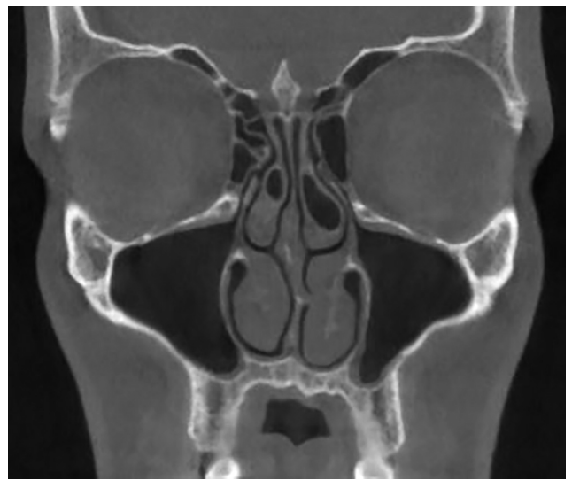
Figure 3. Sinus computed tomography, coronal view of a frequent airline traveler with recurrent episodes of bilateral maxillary and ethmoid pain during ascent (reverse squeeze), associated with bilateral V2 trigeminal nerve anesthesia versus tingling sensation. Bilateral concha bullosa were noted to compress the ostiomeatal complexes (OMC) and narrow the bilateral maxillary infundibulae, in addition to mild septal deviation–broad septal width and profound inferior turbinate hypertrophy. Treatment for this presentation of recurrent acute barosinusitis is noted in the accompanying text.

The CT of a patient who had nasal congestion and experienced several episodes of bilateral maxillary and ethmoid pain during commercial air travel is presented in Fig. 3. Most pain occurred during ascent (reverse squeeze) and was associated with bilateral V2 trigeminal nerve numbness and tingling. Bilateral concha bullosa with the ostiomeatal complex narrowing was present, without evidence of mucosal thickening or sinusitis on imaging. He underwent surgery to both improve his nasal airway (septoplasty and submucosal turbinate reductions) and sinus patency (concha bul-