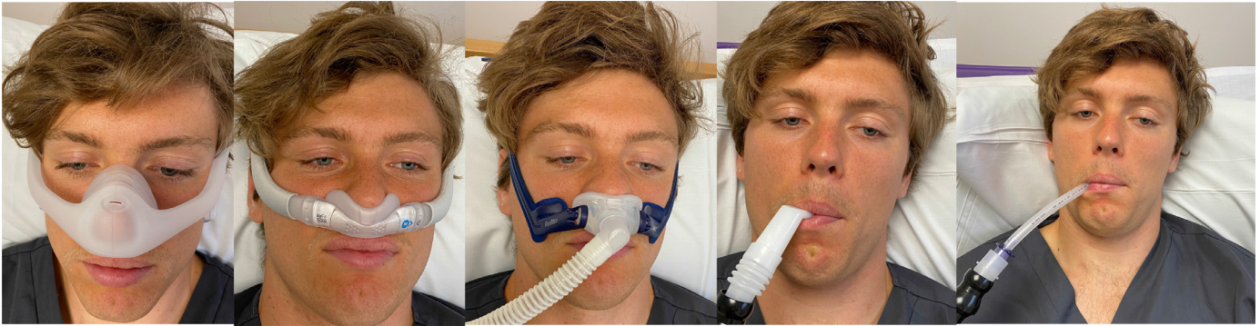
Fig. 2. Fig. 2 shows five photographs, the left hand shows a patient with a nasal mask (Dreamwear, Phillips Respironics, Murrysville, PA, USA). The second left photograph shows the patient using a nasal mask (AirFit N30i ResMed, San Diego, CA, USA) The centre photograph shows the patient using a nasal pillows interface (Swift Lt, ResMed, San Diego, CA, USA). The two right hand photographs show the same patient using mouthpiece ventilation with a mouthpiece (left) and straw (right) (Phillips Respironics, Murrysville, PA, USA).

[5]. Some patients will develop daytime hypercapnia and subsequently require daytime ventilatory support. Prior to commencing daytime ventilatory support it is best practice to check that the patient is optimally ventilated overnight and using their device for the full period when they are asleep. It is recommended that patients are monitored over night with carbon dioxide ( \text{CO}_2 ) (measured by arterial blood gas, end tidal \text{CO}_2 ( \text{EtCO}_2 ) or transcutaneous \text{CO}_2 ( \text{TcCO}_2 ), oximetry and where possible evaluation of the device software via download.