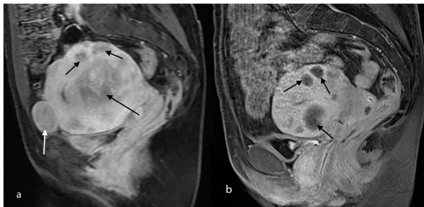
Fig. 1 – (A) Pre-embolization sagittal T1 weighted (W) Fat-Saturated (FS) post-contrast image through the pelvis demonstrates numerous intramural (black arrows) and subserosal (white arrow) enhancing fibroids. (B) Post-embolization sagittal T1-W FS post-contrast image through the pelvis demonstrates multiple intramural non-enhancing treated fibroids (black arrows).

symptomatic uterine fibroids. Case reports are exempt from institutional review board approval at the originating institution.