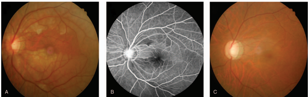
Figure 1. A color fundus photo at the first visit (A) revealed whole-retinal whitening, with the exception of a tongue-shaped zone. Fluorescein angiography (B) demonstrated capillary nonperfusion in the region with obstructed flow. A color fundus photo taken 9 months after treatment (C) demonstrated that the whitening of the original obstructed area had vanished and the tongue-shaped zone was clear.

The left retina was thicker in all quadrants (from 6 \mu\text{m} to 39 \mu\text{m} ) at the first visit than the right retina at the 9-month follow-up (Fig. 3A). After treatment and 9 months of follow-up, the left retina was thinner (from 11 to 110 \mu\text{m} ) than that of the right retina, with the exception of the superior quadrant (7 \mu\text{m} thicker). Correspondingly, the vessel density of the left eye at the 9-month follow-up appointment was improved in all quadrants (from 6% to 19%). However, the vessel density of the left eye at 9 months was still lower than that of the right eye except in the fovea (Fig. 3B). We considered the mean sensitivity (MS), mean defect (MD), and loss variance (LV) to be indicators of general VF