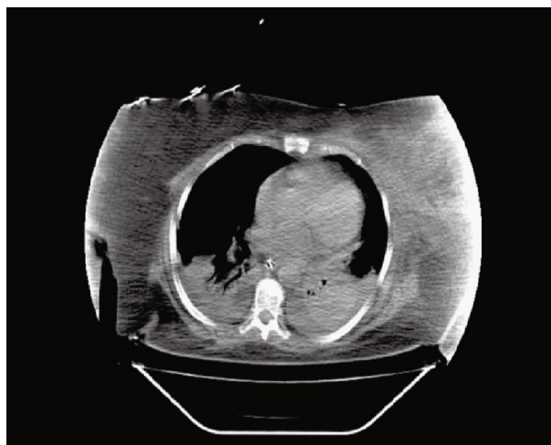
FIGURE 2: Chest tomography showing bilateral pleural effusion, bilateral basal subsegmental atelectasis, and generalized ground glass opacifications.

support with norepinephrine was started, and antibiotic therapy was switched to vancomycin and meropenem.