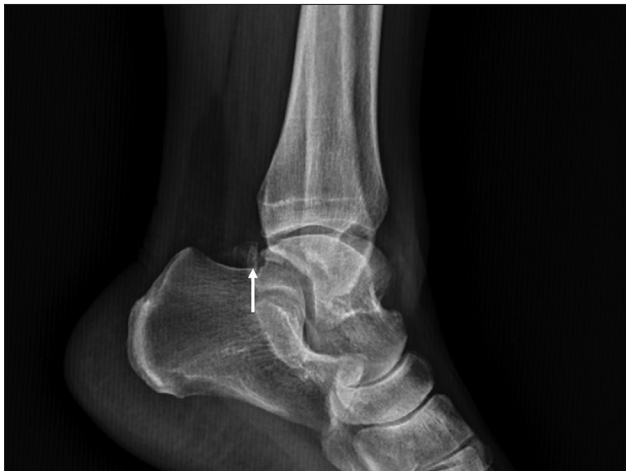
Figure 1: Lateral radiograph of the left foot shows the os trigonum (arrow) behind the talus

A 49-year-old female presented to the clinic with progressive left posterior heel pain for the past 1 month. The pain had worsened substantially during activity. She had a regular exercise habit of running twice per week. There was neither antecedent trauma nor any prior surgery of the affected limb. No history of rheumatic disease was reported, either. On physical examination, tenderness and mild swelling over the left hindfoot were noticed. There was no limitation of ankle range of motion and the Thompson test was negative on the affected side. Figure 1 shows the lateral radiograph of her left foot. An ultrasound examination was carried out and the images of the left foot are presented in Figure 2. What is the cause of her foot pain?