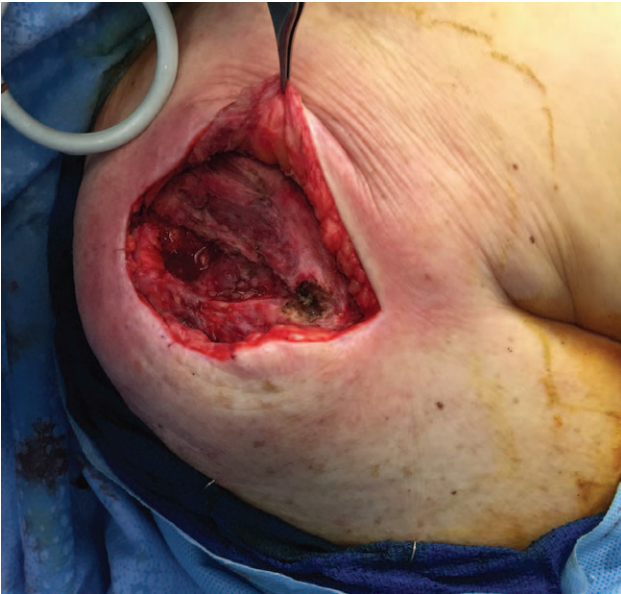
Fig. 1. Debrided open wound with extension of the wound to access deltoid.