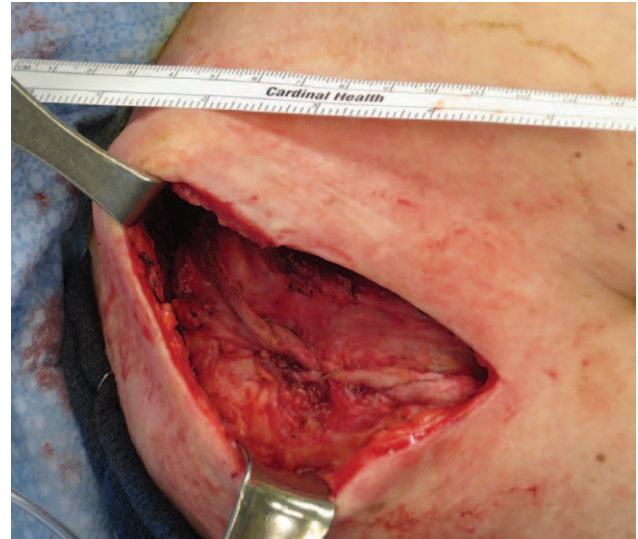
Fig. 3. Anterior head of the deltoid transposed laterally and reattached to the lateral head of the deltoid.

Elevation in the scapular plane involves the anterior and lateral thirds of the deltoid, with increasing involvement of the posterior third above 90°. Abduction in the coronal plane has decreased contribution of the anterior third and increased contribution of the posterior third. Flexion is produced through the actions of the anterior and lateral thirds with contributions from the clavicular head of the pectoralis major, which shares many functions with the anterior third of the deltoid and the biceps. The actions of the pectoralis and the biceps are so small that, without the deltoid, the arm could not be held up against gravity. 5