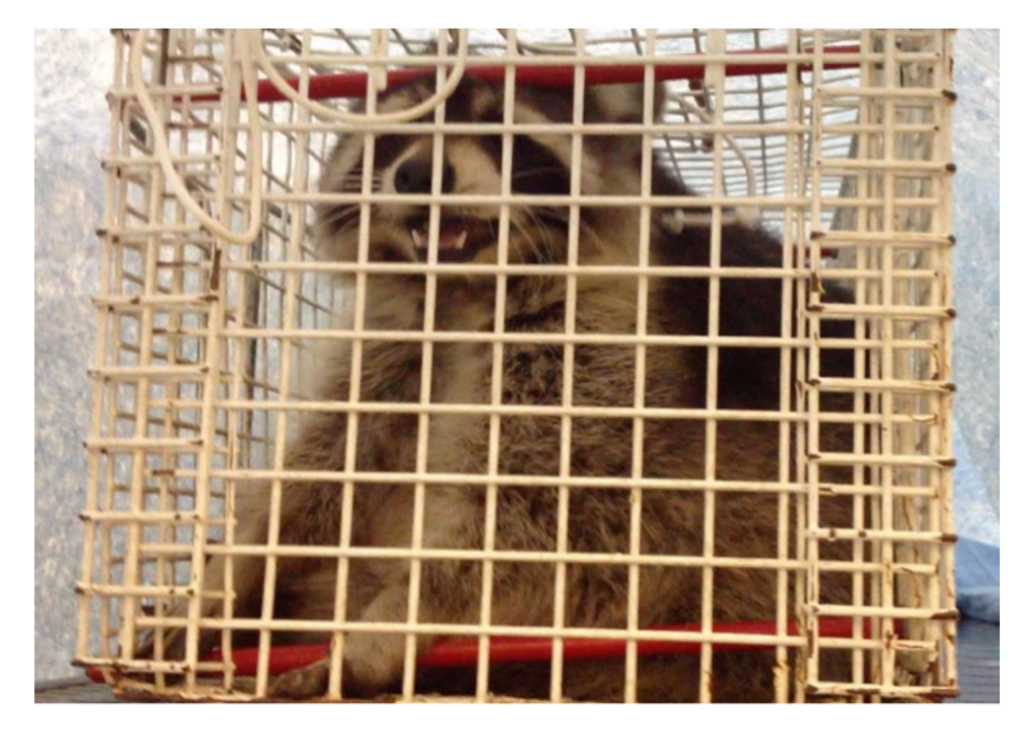
Figure 1. A wild raccoon placed into the squeeze cage to receive the intramuscular (IM) injection of the anesthetic mixture before gonadectomy.

Twenty-four hours before the procedure, the animals were hospitalized at the VTH. Food and water were withheld for 12 h before surgery. On the day of surgery, the raccoons were weighed with a digital platform scale. Animals were identified as either juvenile or adult based on presence of external genitalia, body mass and teeth consumption [18]. The RANDBETWEEN function of Excel was used for allocation of animals into two groups to receive one of the following drugs combinations intramuscularly (IM): 7 mg/kg ketamine (Ketavet 100^{\text{(R)}} , MSD Animal Health S.r.l., Segrate, MI, Italy) with either 7 µg/kg dexmedetomidine (Dexdomitor, 0.5 mg/mL, Elanco Animal Health, Eli Lilly Italia S.p.A., Sesto Fiorentino, FI, Italy) (KD group), or 0.3 mg/kg midazolam (Midazolam I.B.I., 0.5\%^{\text{(R)}} , Aprilia, LT, Italy) (KM group). All drugs were mixed in the same syringe and injected in the triceps muscle with the animal in a containment cage equipped with a squeeze chute (Figure 1).