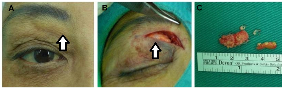
Figure 1 Clinical photographs of the right eye.

Notes: Arrow in (A) points to a mass lesion below the eyebrow. Arrow in (B) points to a well-localized mass over the subcutaneous region. (C) The yellowish mass is 2 cm \times 1 cm in size with irregular border and rubbery consistency.