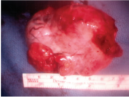
FIGURE 1: Gross specimen of right ovary with attached benign testosterone producing germ cell tumor ultimately diagnosed as steroid cell, not otherwise specified.