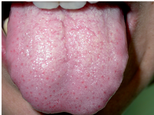
Fig. 1. Multiple erythematous enlarged fungiform papillae on the anterior tongue dorsum (#7).

allergic reaction, while all denied regular use of antiseptic mouthwashes. Three patients (cases #2, #4 and #8) reported “geographic tongue” that was present at the time of examination in one of them (case #2). Habitual lingual trauma was reported by 2 patients (cases #7 and #10), although in 3 more patients (cases #1, #3 and #11) a diffuse erythematous area on the tip of tongue was indicative of tongue thrusting. In case #1 tongue thrusting on an upper fixed orthodontic appliance was con-