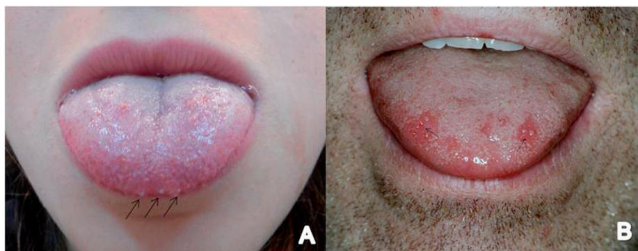
Fig. 2. Localized form of TLP affecting A) both sides of the tip of tongue (#1) and B) the anterior tongue dorsum (#2).

The cases presented herein were consistent with TLP. Although there are no clear diagnostic criteria for TLP,