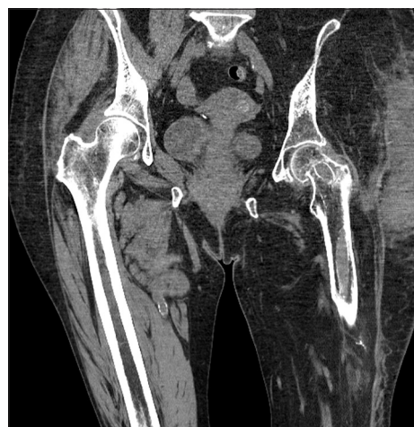
Figure 2: CT scan documenting sub-capital fracture of the femur