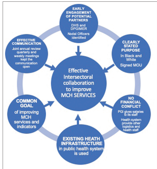
Figure 3: Model leading to effective collaboration to improve MCH services

Similar collaborations have been tried in specific fields in supportive supervision clinical audits, but none of the studies has tried it in such a comprehensive manner, with the whole community being a party to this activity. [29,30] Previous studies have presented population-level outcomes with some improvements that can be potentially attributed to activities of the collaborative partnership. A case study of an initiative to