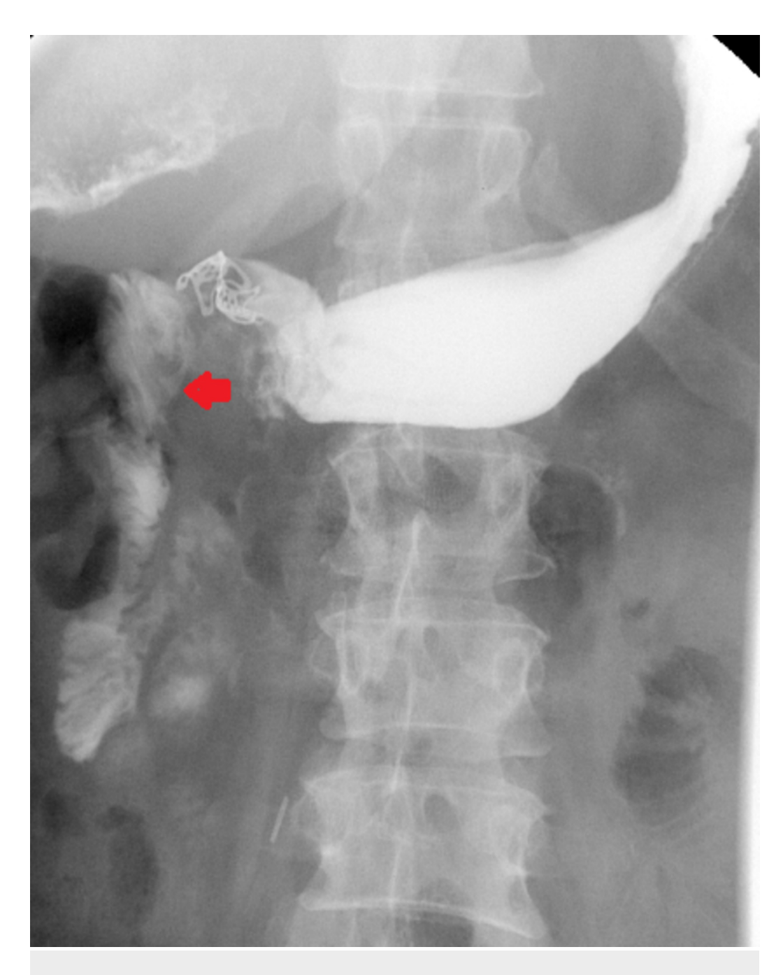
FIGURE 3: Repeat upper gastrointestinal fluoroscopic contrast study performed post-argon beam coagulation of the fistula showed complete obliteration of the fistula tract

After confirmation of fistula obliteration, a video-assisted thoracoscopic surgery was performed followed by the washout of the right pleural space with the placement of a right-sided chest tube. The patient was discharged home after the procedure and has been followed by multidisciplinary teams on an outpatient basis.