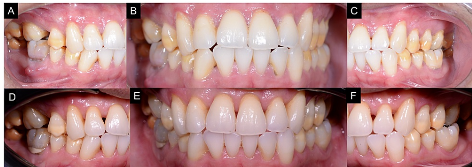
FIGURE 1: (A) Pre-operative right buccal view. (B) Pre-operative frontal view. (C) Pre-operative left buccal view. (D) Post-operative right buccal view. (E) Post-operative frontal view after seven months of at-home bleaching showing the discolored bands had post-bleaching shades ranging from B3 to A3.5. (F) Post-operative left buccal view.

Intraoral examinations revealed that all premolars and second and third molars were affected. The anterior teeth were spared. The discoloration showed a yellowish-brown banding over the occlusal and middle thirds of the affected teeth (Figures 1A-1C). The discoloration was more generalized over the mandibular third molars. There were signs of hypoplasia related to the affected teeth clearly visible on the occlusal surfaces of the premolars (Figures 2A, 2B); however, this was not confirmed as this may be due to other illnesses or interruption during mineralization for which the tetracycline had been originally prescribed [8]. No invasive treatment was applied as the patient was not concerned about the hypoplasia, and a patient-centered approach was followed in this case.