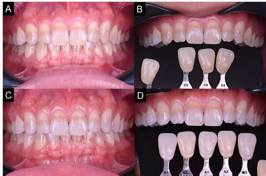
FIGURE 4: (A) Pre-operative frontal view. (B) Pre-operative shade of C2. (C) Frontal view after six months of at-home bleaching. (D) Post-operative shade of A1 was achieved and retained; however, the band discoloration still persists.

Intraoral examinations revealed a yellowish-brown discoloration with a dark brown band affecting all his maxillary and mandibular anterior dentition and all four first permanent molars sparing the premolars (Figures 4A, 4B). The discoloration appeared at the cervical third of central incisors, moving more coronally as it approached the lateral incisors and canines, while on the first molar, it was isolated on the cervical third. Otherwise, the patient had an unrestored dentition with the basic periodontal examination (BPE) scored 2 at the mandibular anterior sextant.