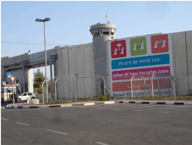
Figure 2 Illustration of Bethlehem checkpoint.

to trauma and violence was very high. The experience of the teenagers was horrific: 80% had seen shootings, 28% had seen a stranger killed, 11% had seen a friend or neighbour killed and 54% of boys had experienced body searches. Not surprisingly, 10.4% of the participants had a depressive-like state, 14.1% emotional difficulties and 10.3% somatic disorders.