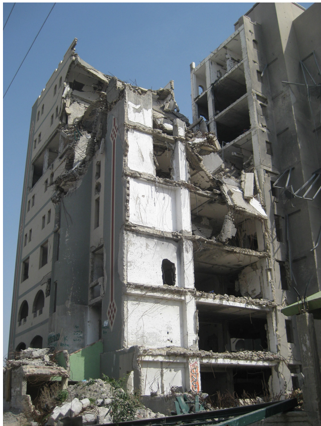
Figure 3 Illustration of destruction in Gaza

The accident mortality in children under 14 years in 2009 was 12.1 per 100 000. Shaheen showed that the leading