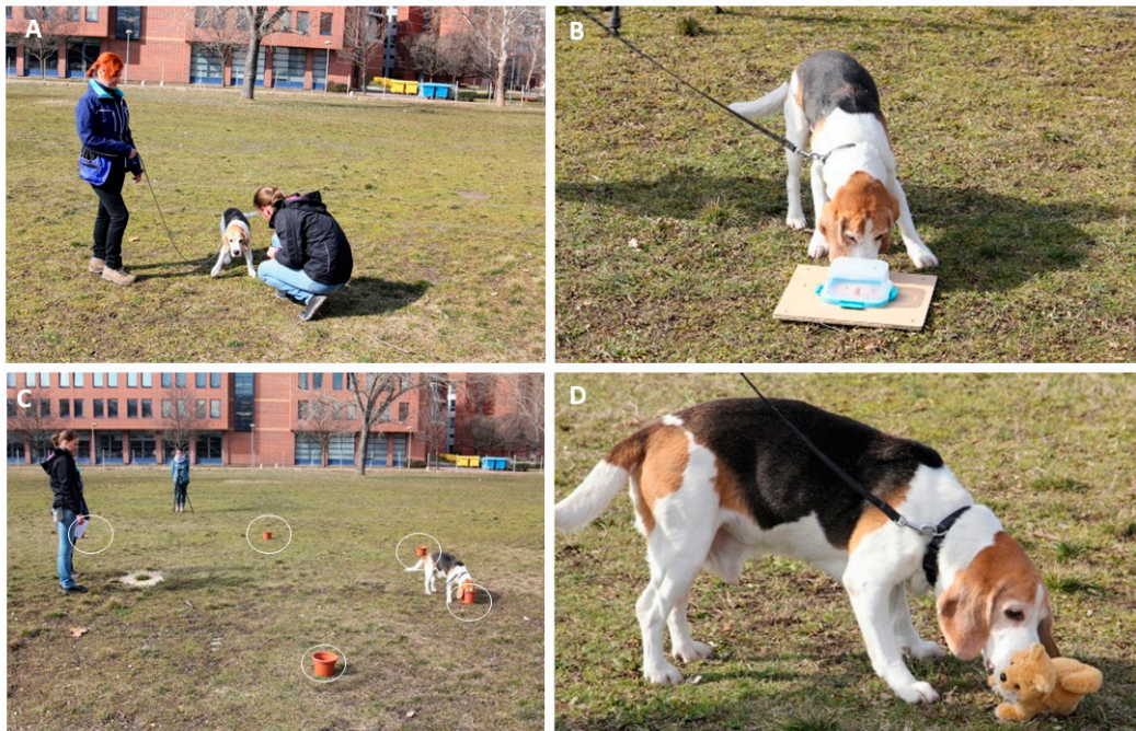
Figure 1. Example images from four sub-tests: greeting (A), problem box (B), memory (the pots are highlighted with yellow ovals) (C), novel object (toy dog, D). The persons identifiable in the images provided written consent for publication.