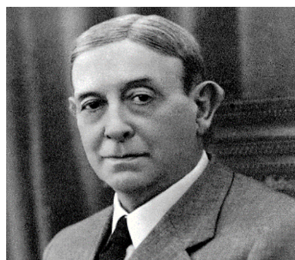
Figure 3. Egas Moniz (1874-1955); his ears were deformed by gouty tophi

The third major breakthrough appeared in the second decade of the 20 th century. Antonio Egas Moniz (1874-1955) (Figure 3) developed an interest in obtaining images of cerebral vasculature to safely visualize brain tumors. 17 Moniz was a Portuguese neurologist and a leading politician for progressive causes in his country. His birth name was Antonio Caetano de Abreu Freire. He adopted the nom de plume of Moniz for a medieval Spanish hero who defended his country against the invading Moors.