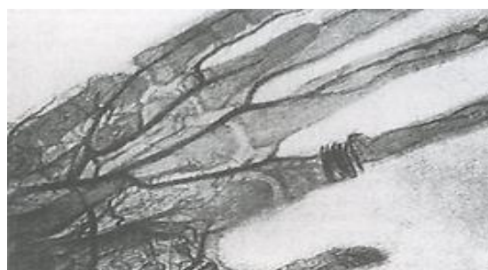
Figure 1. X-ray after Haschek and Lindenthal's injection of cadaver hand

Objects that were not opaque to X-rays could be visualized by agents that would render them opaque or contrast their outlines. Haschek and Lindenthal 8 injected the brachial artery of a cadaver with Teichmann's mixture, consisting of mercury as the contrast agent along with pumice to visualize the arteries of the hand in 1896 (Figure 1). The neurotoxic effects of mercury and the arterial obstruction that pumice injections would cause prohibited use of this mixture to outline the blood vessels of living animals.