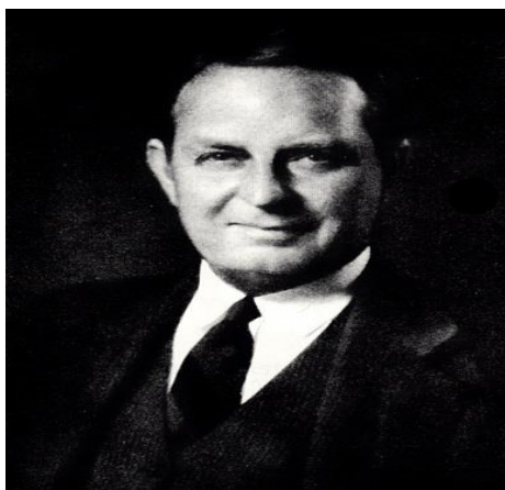
Figure 2. Walter E. Dandy (1886-1946)

that frontal tumors would depress and shift portions of the ipsilateral lateral ventricle. PEG was rapidly accepted in European neurology through the publications of the highly respected Viennese radiographer and neurologist, Arthur Schüller and others. 7,13 Further details about alterations in ventricles caused by intracranial tumors can be found in Diagnostic Neuroradiology. 14