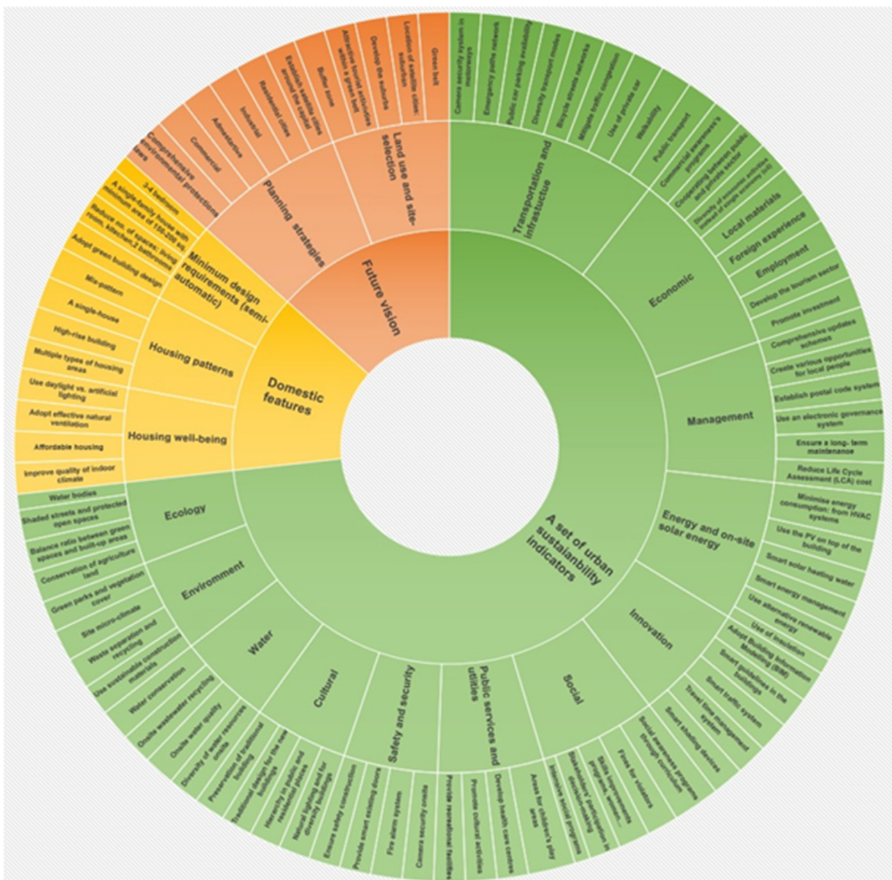
Figure 2. Local sustainable comprehensive framework for Baghdad (LSCFB).

The validation stage followed the development of the framework. The methodology for this validation was based on a series of semi-structured interviews carried out with 15 intra-organizational leaders from a variety of organizations and 7 intra-organizational leaders from official government departments charged with the promotion of sustainability practices. These leaders were responsible for promoting, planning, developing and implementing schemes/plans regarding environmental, social and economic sustainability issues in their respective organizations.