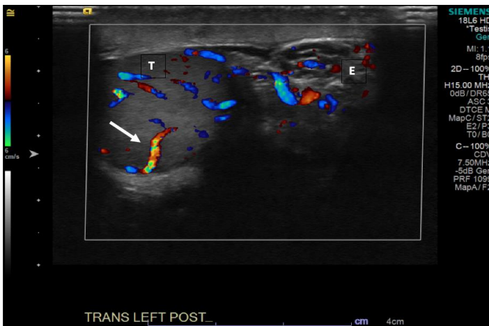
Image 3. Left testicle (T) and epididymis (E) after three complete clockwise rotations of the left testicle (540 degrees) with the white arrow indicating restoration of normal flow to the affected testis.