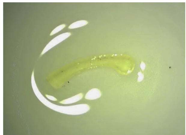
Fig. 2. Intraoperative image. Image of the haptic fragment taken during surgery immediately after removal from the eye.

IOL haptic fracture and fragment dislocation into the anterior chamber is a rare complication of cataract surgery. Since the