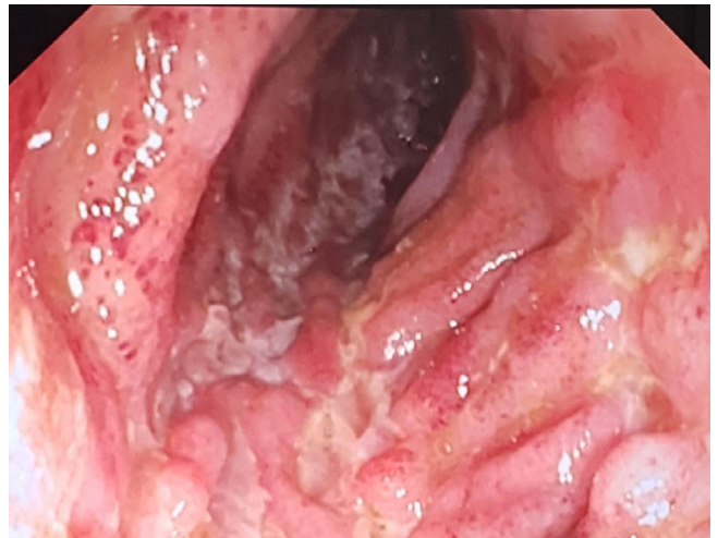
Figure 1. An ileocolonoscopy; linear ileocecal valve ulcers, erythema and loss of vascular pattern of the mucosa because of intestinal wall edema.

Lesions of the terminal ileum and small intestine should not always be interpreted as Crohn's disease. Investigation of the colon and/or rectum biopsies for occult Crohn's disease may help clinicians differentiating from other diseases and prevent further research. 29 It involves a variable differential diagnosis including tuberculosis and/or unusual infections, primary cancers and lymphomas of the intestine, metastases from other organs, Behçet's disease and/or other vasculitides, and side effects of drugs. 30 Neoplasms of the small intestine are uncommon and are often delayed due to nonspecific symptoms and findings, and is inaccessible by endoscopy. 31 Variable radiographic patterns including circumferential lesion, cavitory lesion, and mesenteric nodal disease may be present for lymphoma. 32 Those patients with colorectal and/or gastric involvement, diffuse macroscopic infiltration, perforation, and high-