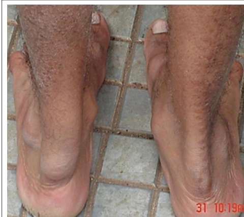
Figure 6: Post-operative follow up after 2 years revealing painless and minimal enlargement of the operated tendon on the right side.