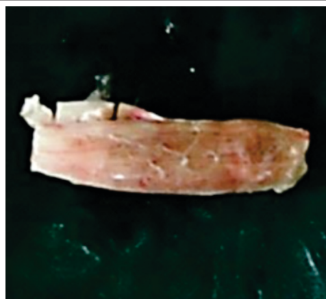
Figure 5: Excised piece of the affected tendon during surgery on right side, measuring 6x3 cm.