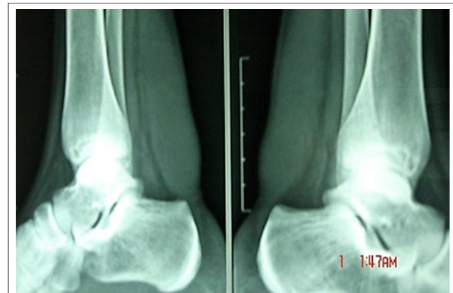
Figure 3: Lateral view radiograph of both the ankles, showing fusiform homogenous soft tissue shadow in area of tendoachilles.