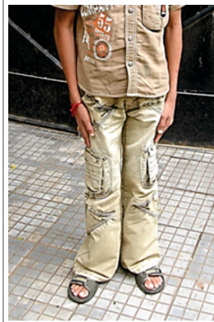
Figure 1: Clinical photograph of the patient Short statured 19 year old - measuring 144 cm in length.

On detailed retrospective inquiry, he had surgery for bilateral juvenile cataracts at the age of 8, along with history of chronic intractable diarrhea. He was coherent and co-operative but