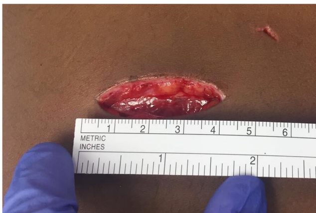
Fig. 1 Horizontally oriented lumbar wound

within all ventricles, prepontine, and subarachnoidally (Fig. 3).