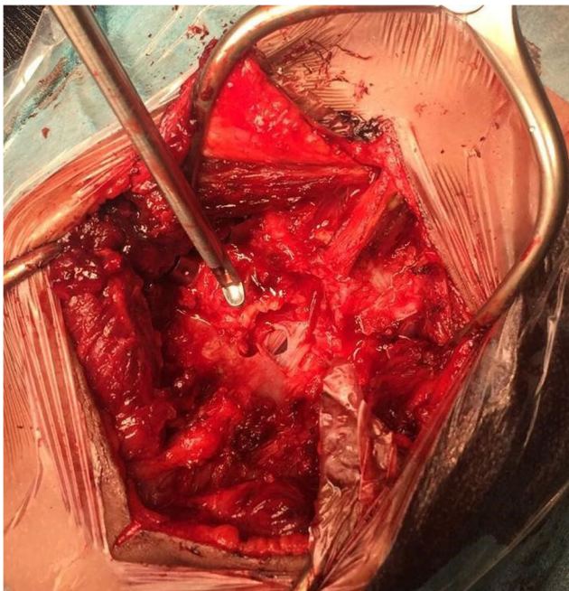
Fig. 4 Preoperative view, after laminectomy L4 and flavum decompression, of the dural laceration

The main cause of pneumocephalus in 75% of patients is neurotrauma, especially with the presence of skull base fractures [2, 7, 14]. Causes in the other 25% are tumors, infections, and iatrogenic causes, the last two after cranial and spinal surgical procedures or local lumbar procedures [5, 8, 14, 19]. In very few case reports, pneumocephalus as a complication of spinal trauma, like thoracic or cervical stab wounds, is described. Here, patients were treated conservatively [10, 11, 17]. However, a rapid decrease in consciousness after lumbar trauma, with extensive amounts of intraspinal and intracranial air demanding for emergency surgery, has not been reported.