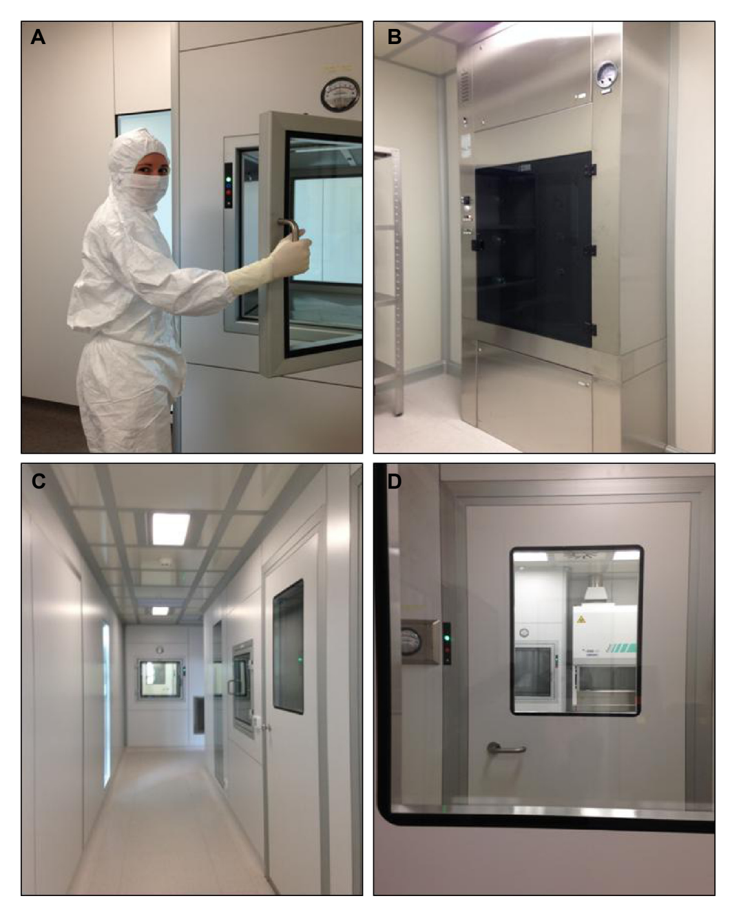
Figure 1 Representative pictures of the classified areas inside the Cell Factory.

Notes: (A) A GMP operator at work. The ventilated pass box is used to introduce the materials in the cleanroom. (B) An air shower in the storage room of a production site. It is used to remove the dust before introducing the materials in the classified areas. (C) Exit lane from the cleanroom. Each working room has its own, separated exit for the personnel and pass box for the materials. (D) An overview of the area for the preparation of materials. To access this area the operator must go through rooms of increasing air cleanlines.