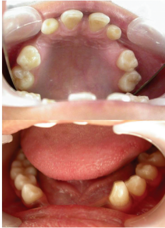
FIGURE 3: Upper and lower arch showing missing teeth.