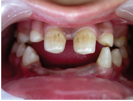
FIGURE 1: Missing lower anterior teeth.