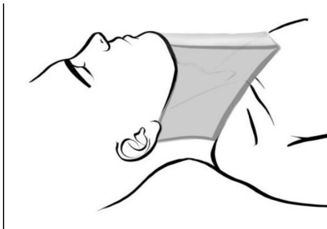
Figure 3 A custom-made ultrasonographic coupling pad in the shape of an arch.

We define the parallel trunk reference line through the mentum as the XU-line (X line on ultrasonographic images), by which we will evaluate the spatial displacement of the pre-airway tissue (figure 2). To measure the distance from the pre-airway tissue to the XU-line, we will use a custom-made ultrasonographic coupling pad, with a thickness designed to reach the chin level (figure 3). The ultrasonographic coupling pad is in the shape of an