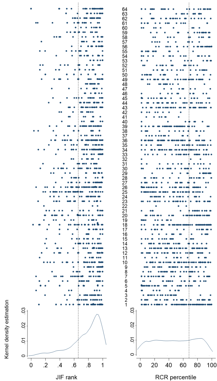
Figure 1. Beam plots and Kernel density estimation of JIF rank and RCR percentile of all original publications submitted by candidates for academic promotion at the University of Bern. JIF rank (left panel) and RCR percentile (right panel) are shown for each article submitted by candidates for habilitation (1-34) and associate professorship (35-64). Each candidate corresponds to one row. Kernel density estimation (epanechnikov, bandwidth=5.0) for JIF rank (left panel) and RCR percentile (right panel) are shown below. The broken lines show rank 0.66 (left panel) and RCR percentile 66 (right panel).

The beam plot in Figure 1 shows, row-wise for each candidate, the JIF ranking and RCR percentile of all 64 candidates. The kernel density estimation at the bottom of Figure 1 shows the differences in distribution of JIF ranking and RCR percentiles. As expected from the university regulations, the majority of