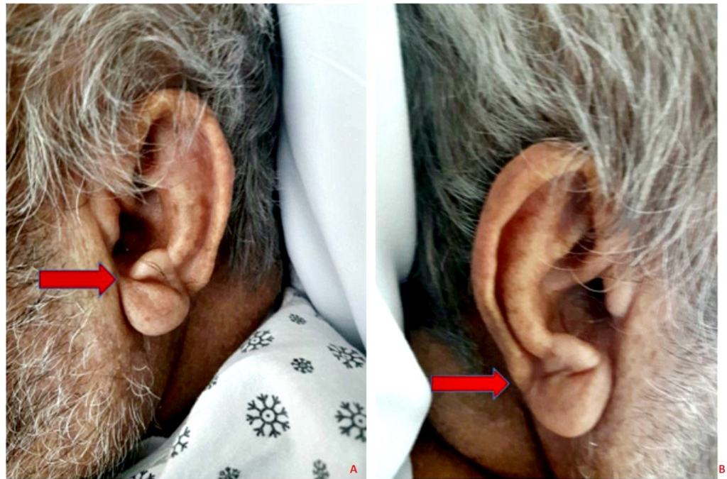
FIGURE 1: Bilateral diagonal earlobe creases as indicated by arrows

pertinent for elevated troponin and D-dimer; troponin peaked at 0.58. He was started on a heparin drip. He underwent computed tomography angiogram (CTA) of the chest which ruled out a pulmonary embolus. A transthoracic echocardiogram revealed an ejection fraction of 35% - 40%, Grade 1 left ventricular diastolic dysfunction, and abnormal septal motion consistent with a conduction abnormality. He subsequently underwent a coronary angiogram which revealed disease of the circumflex artery with a 30% lesion in the proximal segment, a 50% lesion in the distal segment, and a 50% lesion in the proximal segment of the obtuse marginal artery focal lesion) (Figure 2). In view of the presence of non-obstructive CAD, he was started on appropriate medical therapy and discharged with a cardiology follow-up for medical optimization.