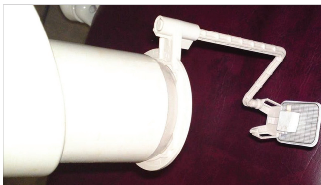
Figure 3: Radiographs taken using the paralleling technique with 1 × 1 mm metallic mesh grid placed between the sample and the film

Both the electronic and the conventional radiographic methods displayed very high correlation and agreement (ICC = 0.99 and 0.98 respectively) with the actual measurements. The electronic and the radiographic methods, on comparison, also suggested a high correlation and agreement (ICC = 0.97) [Table 1]. The radiographic technique overestimated the root canal length in 95% of the total sample. In spite of this overestimation, the radiographic method showed an accuracy of 72% within + 0.5 mm and 95% within + 1 mm. The EAL showed an accuracy of 92% within + 0.5 mm and 100% within + 1 mm. Regression analysis showed that the EAL could predict the actual value with 98.2% accuracy [Table 2] whereas the radiographic method could predict the actual value with 93.9% accuracy [Table 3].