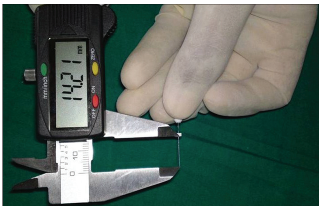
Figure 1: Measurement of the actual length using digital vernier caliper

The study included 100 single rooted primary anterior teeth, which were extracted due to extensive caries, trauma, serial extraction or unwillingness of the parent to save the teeth. All the teeth selected did not show resorption more than 1/3 rd the root length. The extracted teeth were numbered from 1 to 100. The teeth were flattened upto the cemento enamel junction to create a reproducible reference point. Actual measurements were recorded by inserting a 21 mm size 15 K – File into the canal till the tip of the instrument flushed with the apical foramen. Rubber stoppers were then moved to the coronal reference point to mark each canal's length. The files were removed, and root canal lengths were determined using a digital vernier caliper [Figure 1]. This actual measurement was