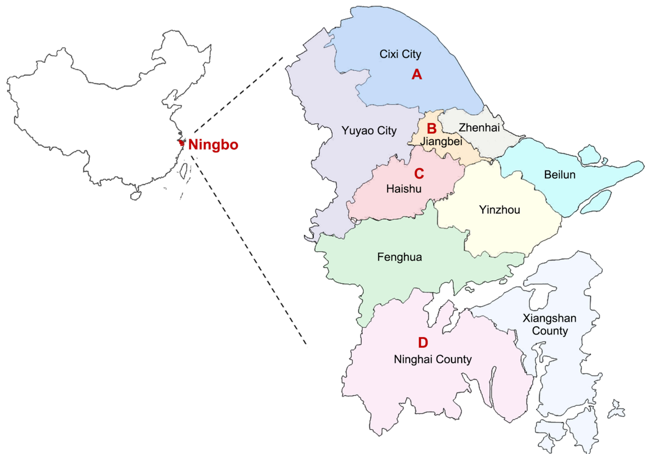
Figure 1 The geography of Ningbo and the four randomly selected districts in the study. Ningbo is an eastern coastal city in China, with a population of 9.6 million. The city comprises ten subsections, including six urban districts: Haishu District, Jiangbei District, Zhenhai District, Beilun District, Yinzhou District, and Fenghua District; two satellite urban county-level cities: Cixi City and Yuyao City; and two rural counties: Ninghai County and Xiangshan County. A-D represent four randomly selected districts in this study.