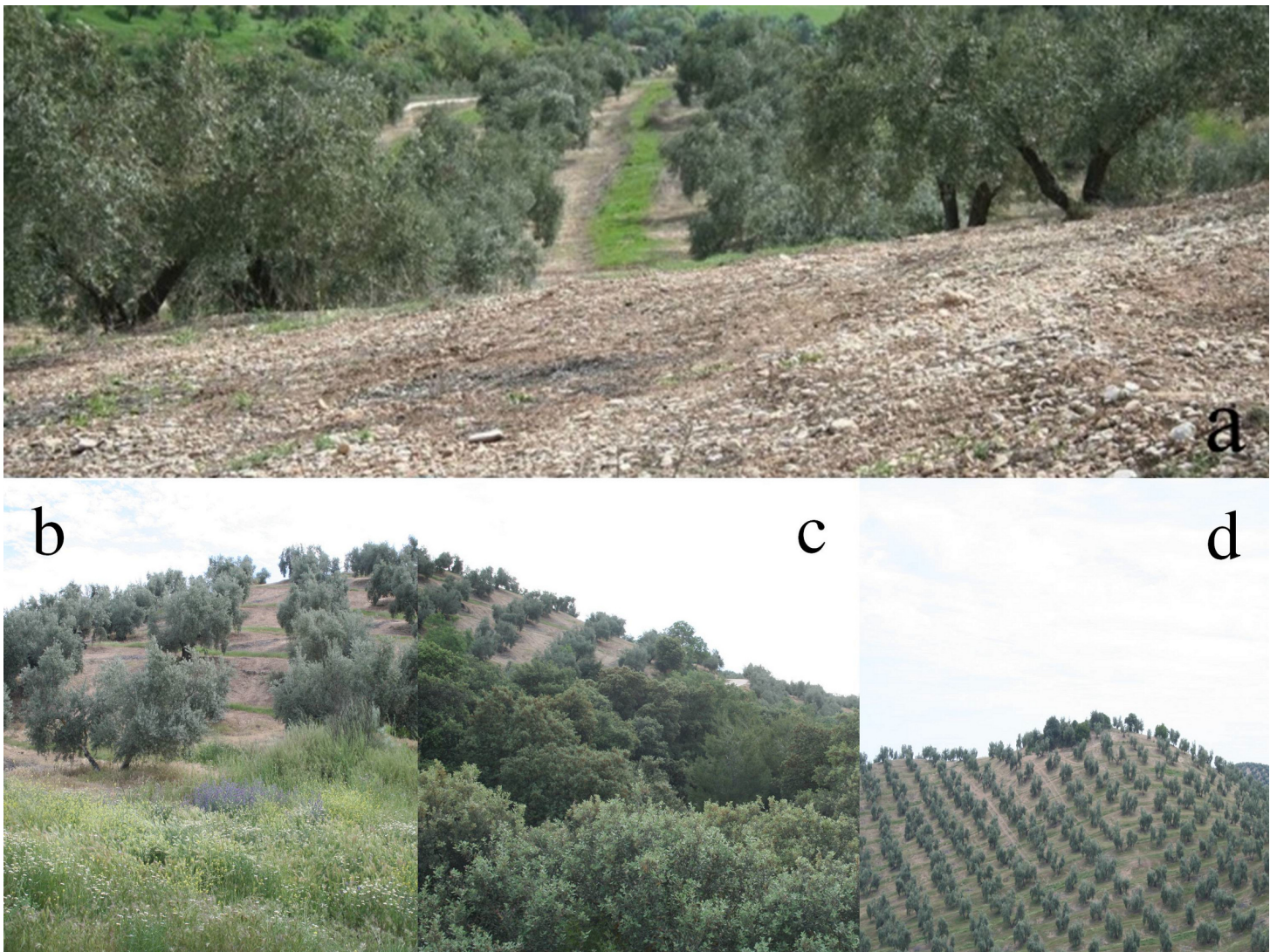
Figure 1 Vegetation treatments. (A) inter row-strips with cover plants (ground cover) and bare soil; (B) herbaceous vegetation adjacent to olive groves; (C) large woody vegetation adjacent to olive groves; (D) small woody patches within olive groves at the top of a hill.

grove for two years before the beginning of the experiment onwards. Other treatments were naturally occurring vegetation patches.